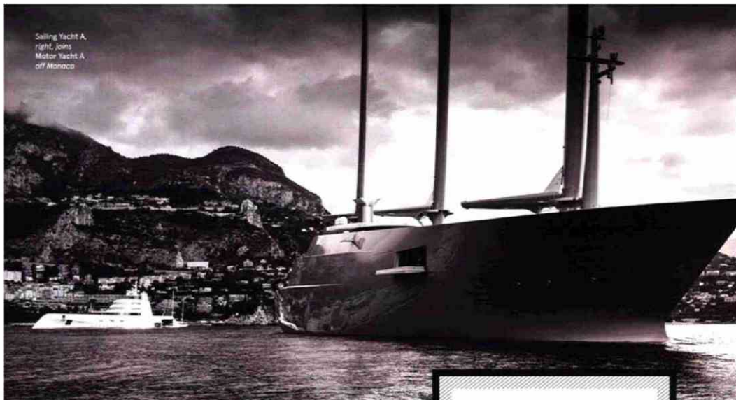
Sailing Yacht A, right, joins Motor Yacht A off Monaco