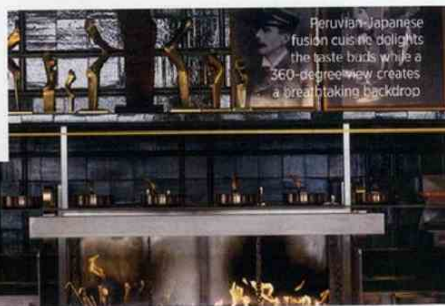
Peruvian-Japanese fusion cuisine delights the taste buds while a 360-degree view creates a breathtaking backdrop.