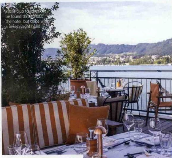
Yacht club touches can be found throughout the hotel, but come with a breezy light hand.