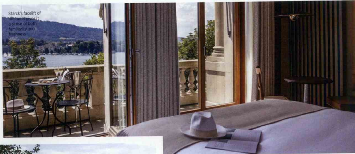
Starck's facelift of the hotel gives it a sense of both familiarity and freshness.