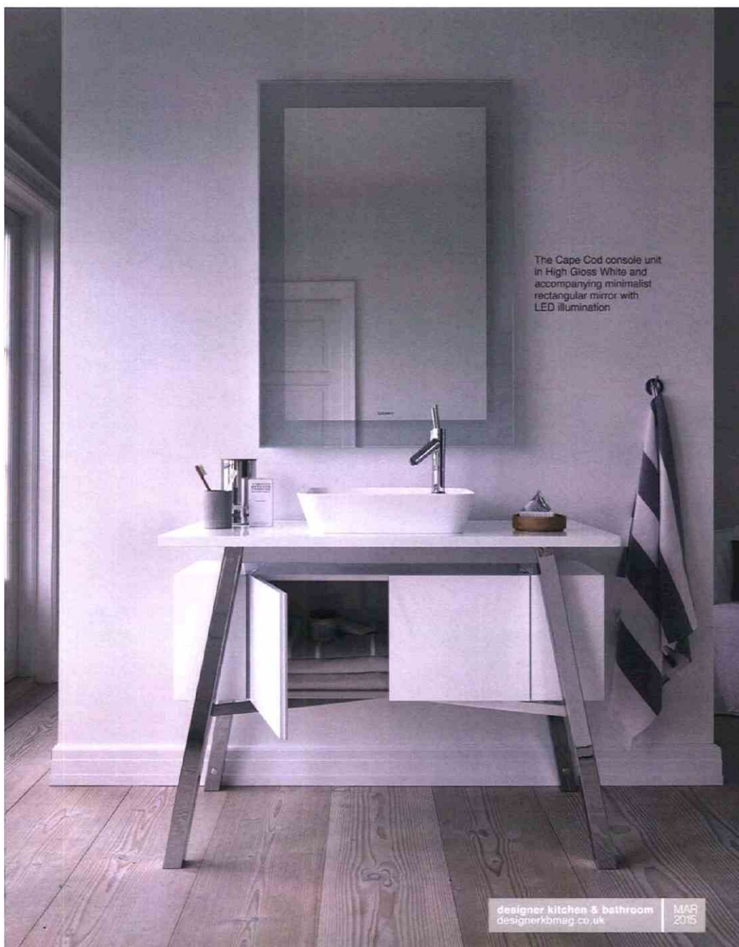
The Cape Cod console unit in High Gloss White and accompanying minimalist rectangular mirror with LED illumination

designer kitchen & bathroom designerkbmag.co.uk