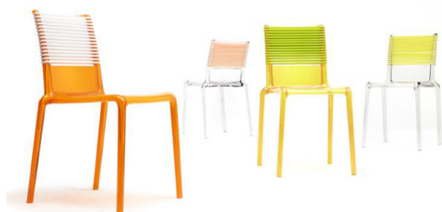
Above: Misa Joy by Philippe Starck, from £160 each

TOG enables its customers to select a standard piece or choose from a range of colour and form options. Starck's sleek, customisable Misa Joy chair (below) offers a comfortable backrest in the form of high tensile strength elastic bands, which are available in packs to allow the user to mix and match to their taste.