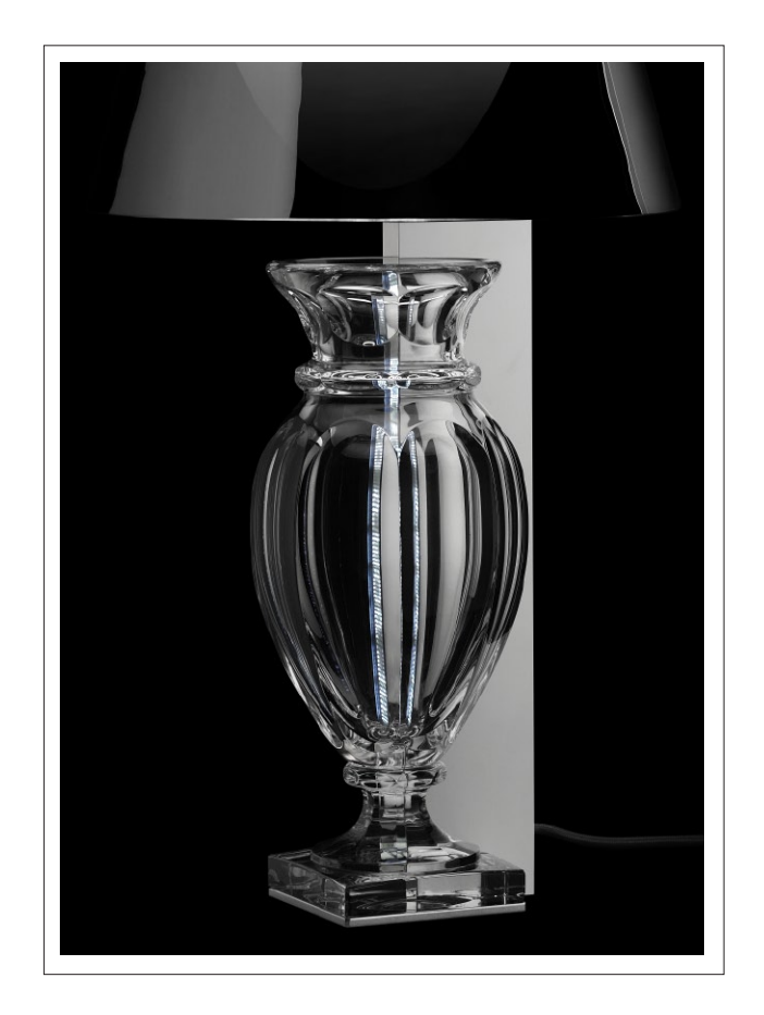
INNER BODY POLISHED ALUMINUM