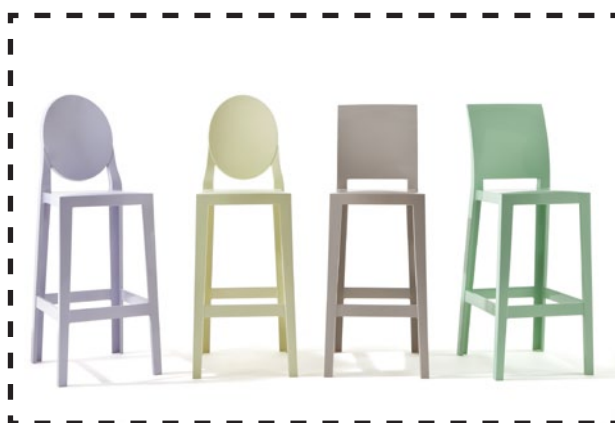
ONE MORE, ONE MORE PLEASE Design Philippe Starck