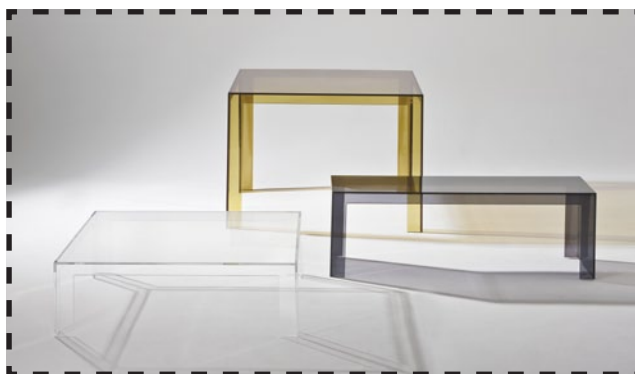
INVISIBLE TABLE and INVISIBLE TABLE LOW Design Tokujin Yoshioka

Material: transparent or batch coloured PMMA Size: W. 100 cm, D. 100 cm, H. 40 cm Colours: crystal, smoke, amber, green algae, plum, teal, white matte, black matte