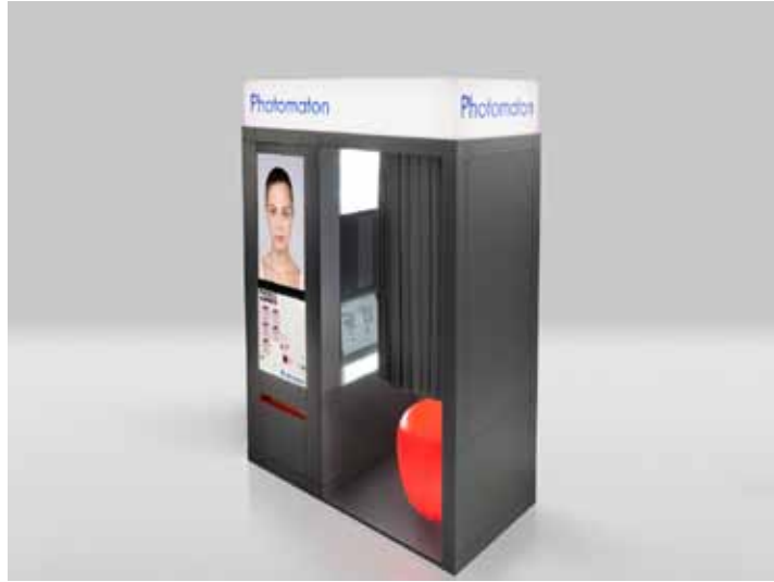
Photomaton (top) Young booster for Photomaton cabin by Starck. Tactil screen, graphic interface, easy going, sober. Trendy for this added reality ! "What would be without this national héritage ? Would we have identity trouble ? Today just re-dressed up with a new quality, our Photomaton is still there to stay up on the identity of our life". Phillipe Starck