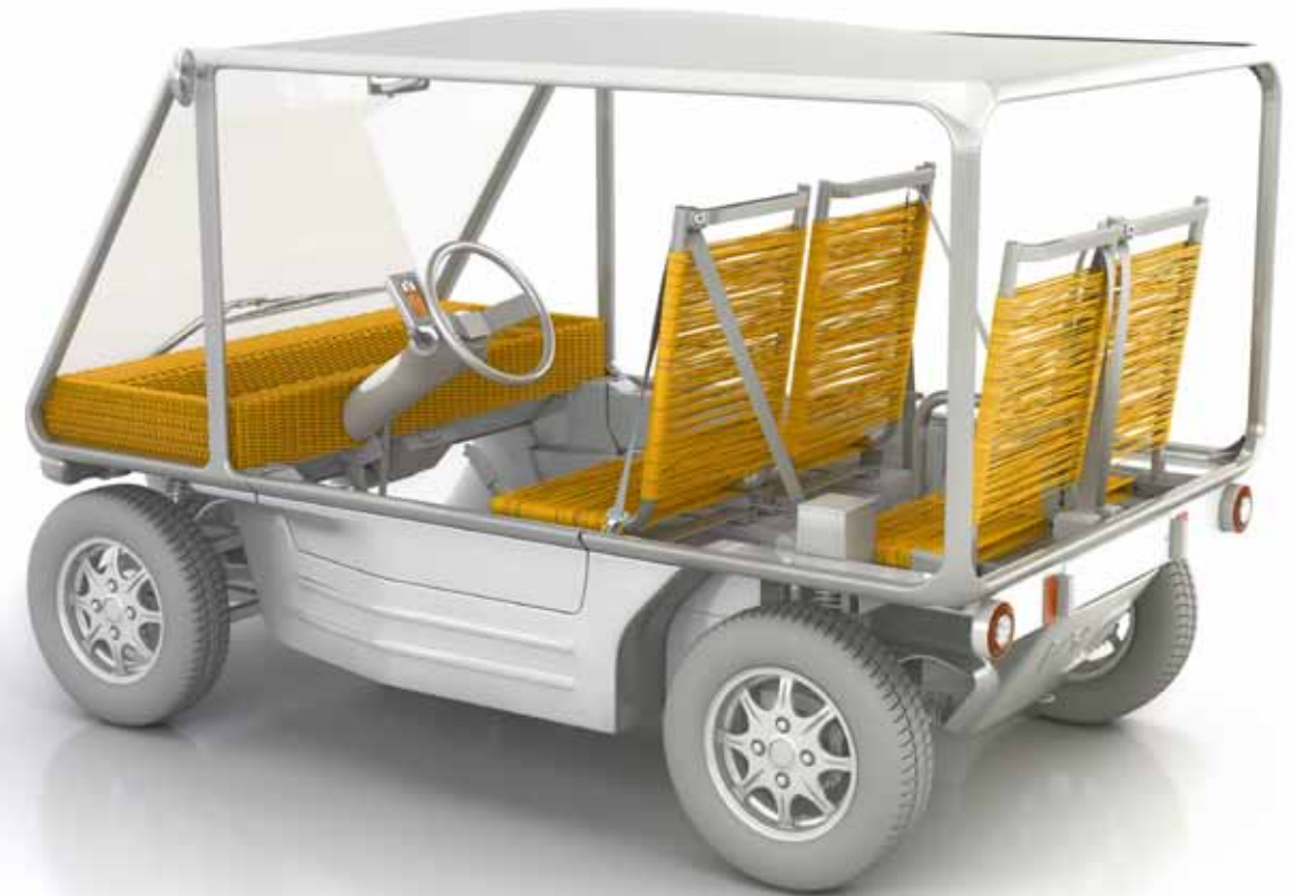
V + Volteis (below) Less and more: two words to describe this unidentified rolling object, designed by Starck and conceived by Volteis, a French brand whose philosophy and know-how pleased the designer. The V+ is an alternative, a first test to provide a light response, desirable, minimal for those looking to move correctly, differently. www.volteisbystarck.com

PS: We need to be very careful. We spent centuries creating a democratic system, a republican system. Like any other, it has its defects, but we need to think very carefully before we decide to destroy something that works pretty well. Democracy is doing what it can. We need to be careful not to play the sorcerer's apprentice. Likewise, the binary system of left and right is widely disparaged, with people saying that it is useless. That's not true, as the more we advance toward a globalised economy, the more real technical choices will no longer be choices. Meaning that the only thing standing be-