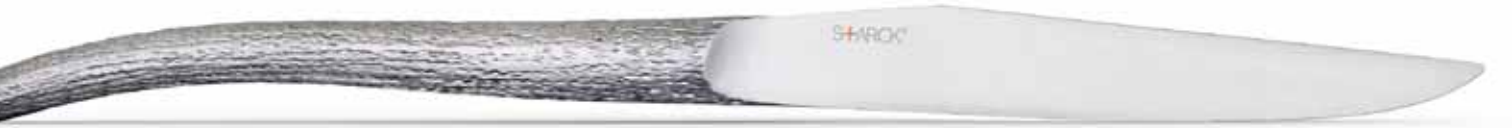
LOG (top) For the 25th anniversary of the Forge Laguiole, Starck created a knife. Handle in stainless steel printed as a piece of wood. The blade prolongs the handle. Reinterpretation of the codes of this knife.