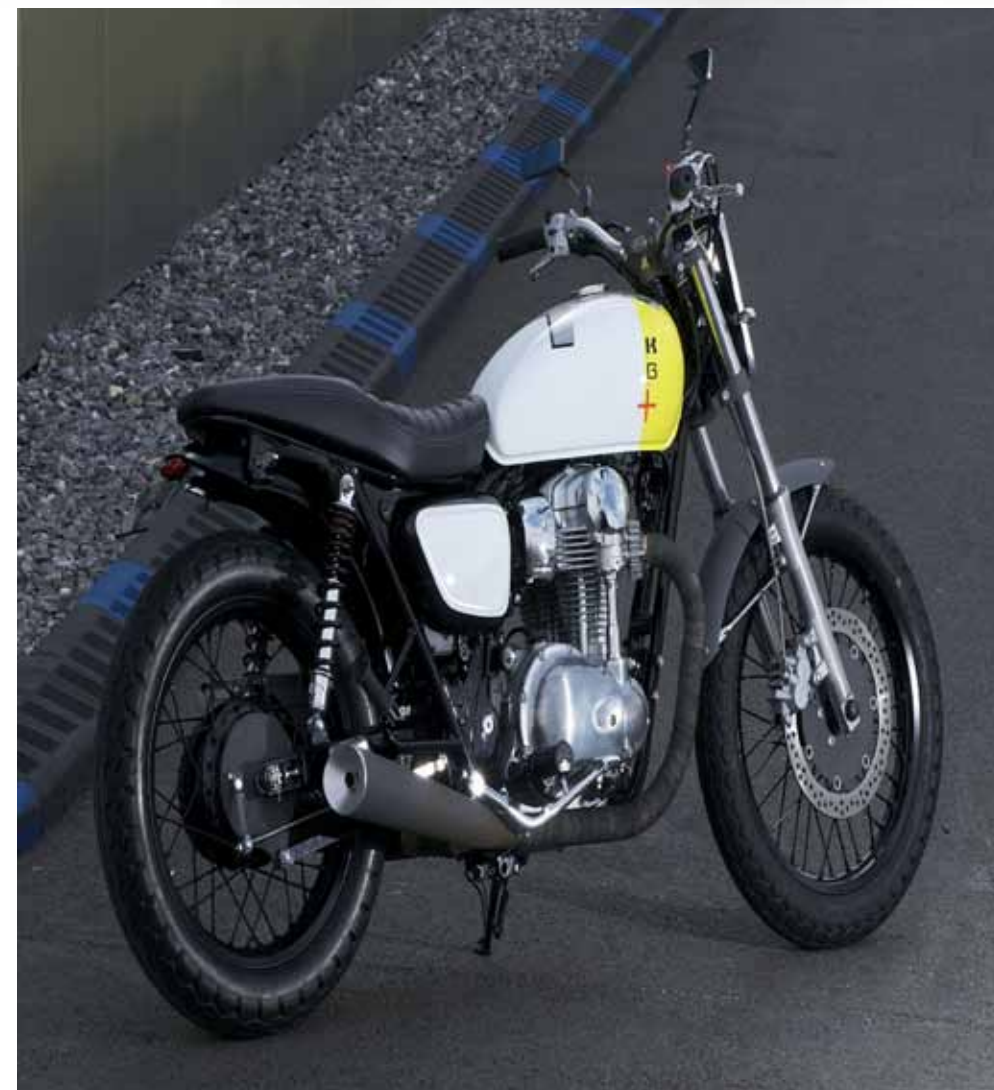
Kawasaki W800 (left) Since the rebirth of the W in the early 2011 in a 800cm 3 version, Starck got the envy of realize a new dream. "Since my young age, I have two wheels under my foot. I am a biomechanical human being, half man, half two wheels. The moto is a body extension for me". Philippe Starck