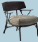
A.I. Lounge des. P. Starck