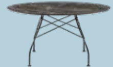
Glossy Family XXL des. A. Citterio