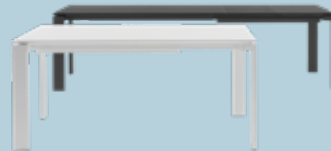
Four Family des. F. Laviani