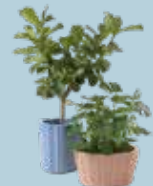
Corteza des. P. Urquiola