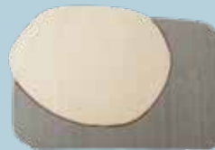
AAland des. P. Urquiola