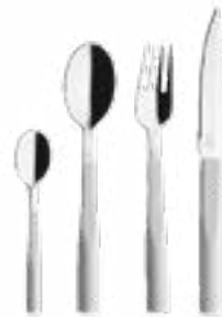
Opaque plastic finish