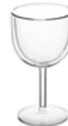
The Invariable Wine glass