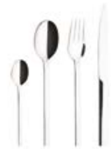
Stainless steel finish