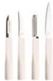
Opaque plastic finish