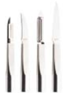
Stainless steel finish